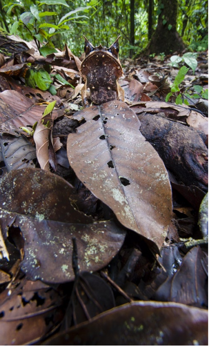
"Horned frogs on the forest floor are exquisitely camouflaged and tough to find"

My preferred habitat is tropical rainforest and there are few finer places to experience its magical atmosphere and splendour than Danum Valley in Sabah, Malaysian Borneo. Few sights are more evocative than ethereal early morning mists draped over the canopy, with the melodic calls of gibbons hanging in the air. Photographing animals in the canopy is very difficult, so I concentrate on the forest itself and the smaller things lower down – frogs, reptiles, insects. Horned frogs on the forest floor are exquisitely camouflaged and tough to find, but they are one of my favourite animals and I relish the challenge to showing them in the context of their environment